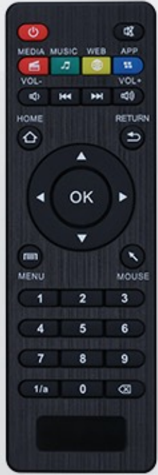
Remote control (Battery not Included)