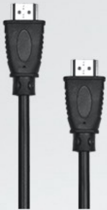
HD data cable